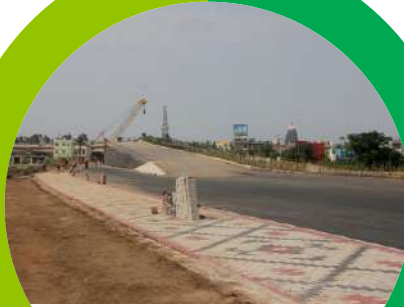
Odisha Rural-Urban Transition Policy