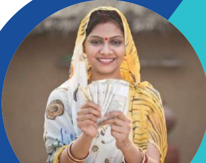
New Swarnima Scheme For Women