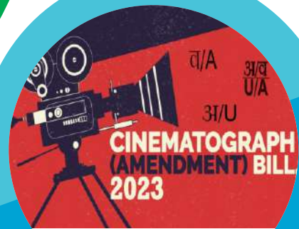
Cinematograph Amendment Bill