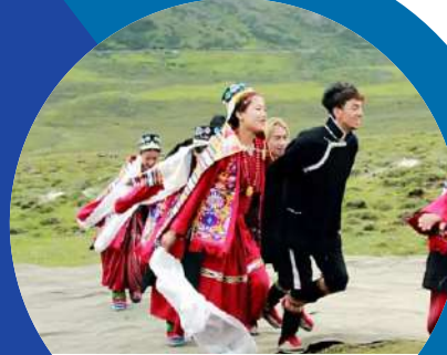
Chachin Grazing Festival

Disclaimer: Copyright infringement not intended.