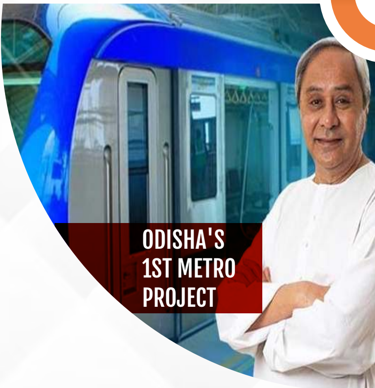
ODISHA'S 1ST METRO PROJECT