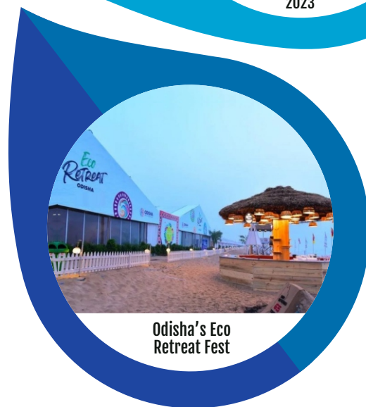
Odisha's Eco Retreat Fest

Disclaimer: Copyright infringement not intended.