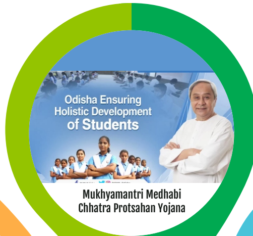
Mukhyamantri Medhabi Chhatra Protsahan Yojana