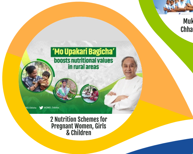
2 Nutrition Schemes for Pregnant Women, Girls & Children