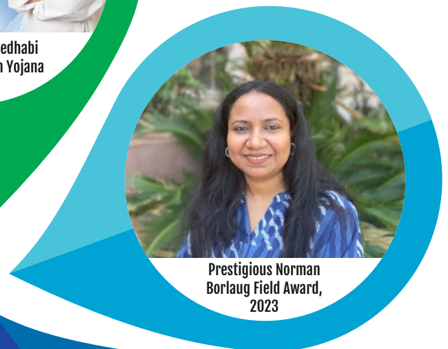
Prestigious Norman Borlaug Field Award, 2023