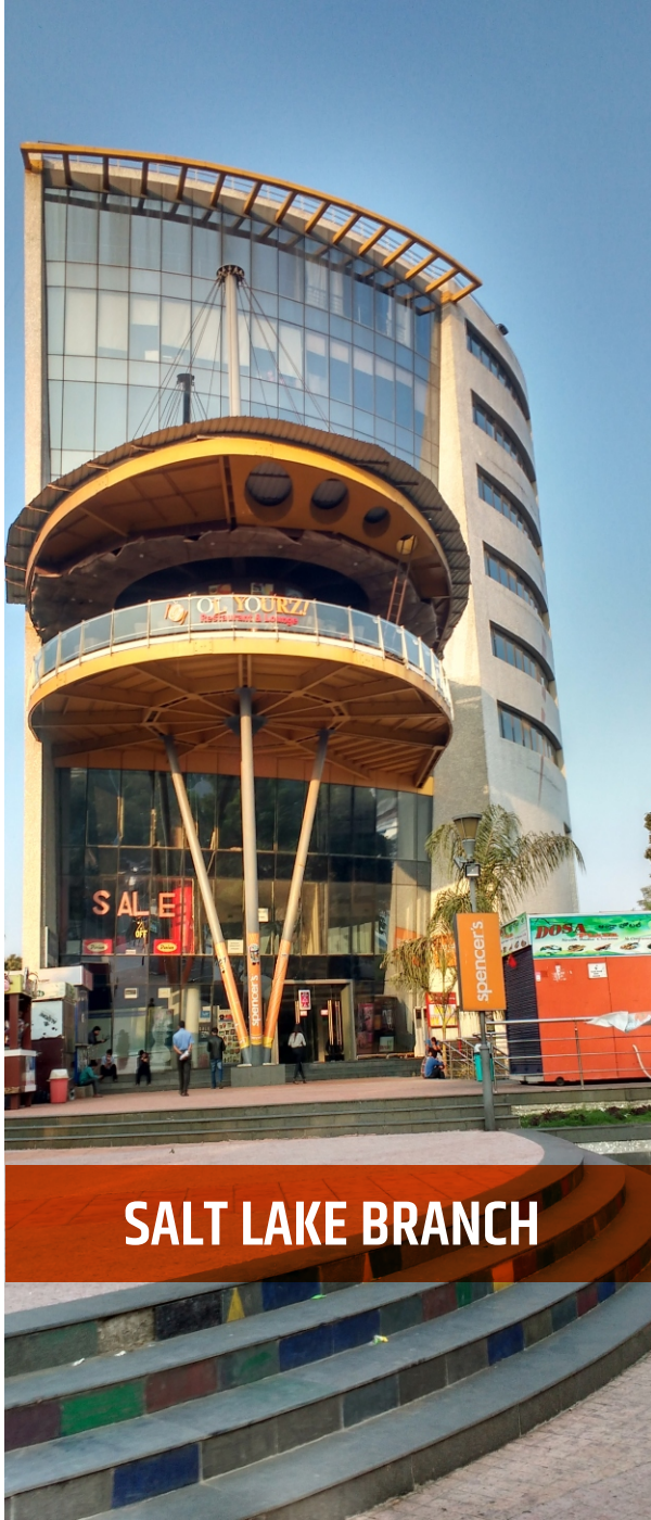
SALT LAKE BRANCH