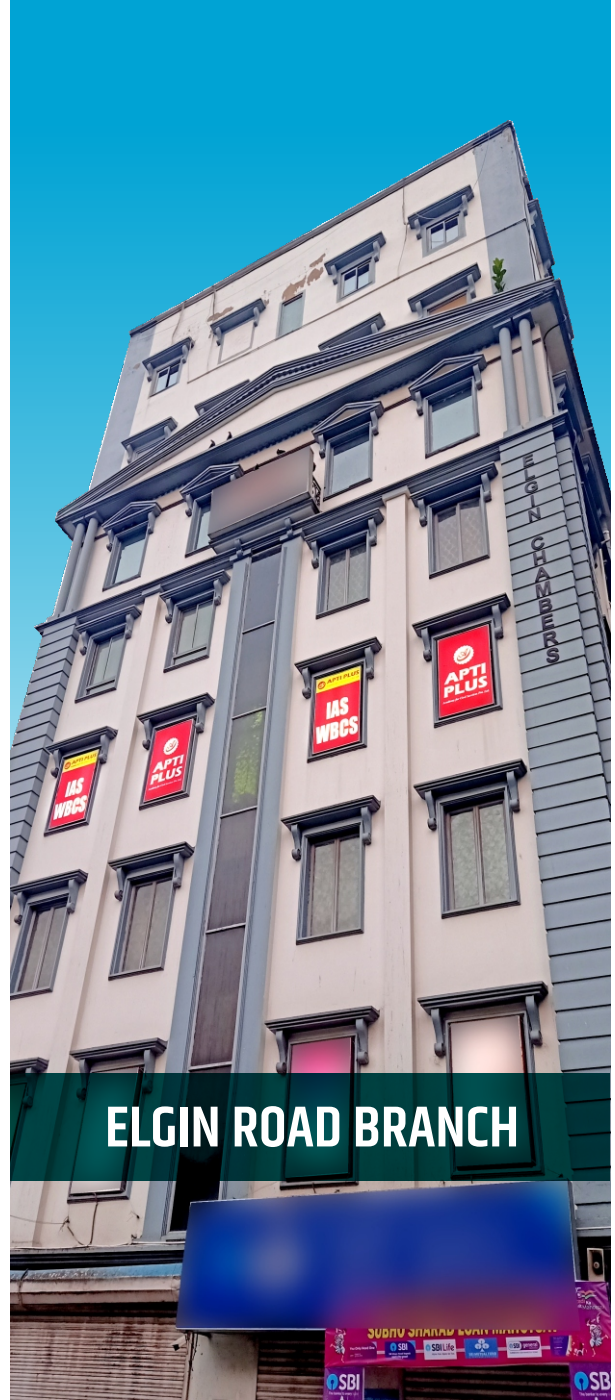
ELGIN ROAD BRANCH