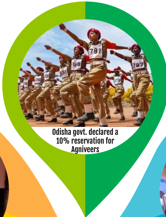
Odisha govt. declared a 10% reservation for Agniveers