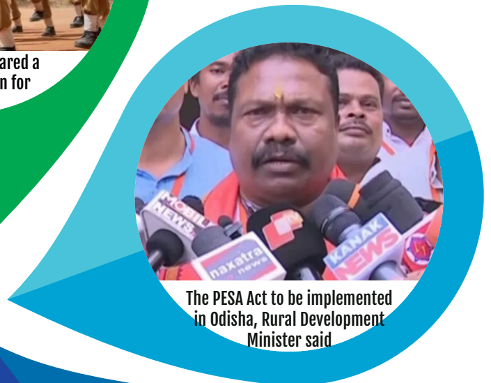
The PESA Act to be implemented in Odisha, Rural Development Minister said