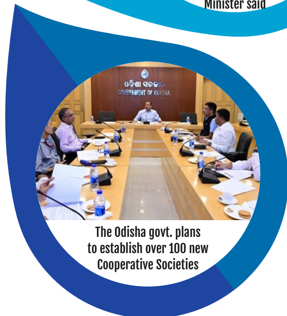
The Odisha govt. plans to establish over 100 new Cooperative Societies

Disclaimer: Copyright infringement not intended.