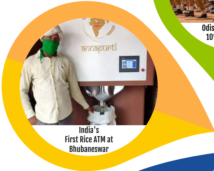
India's First Rice ATM at Bhubaneswar