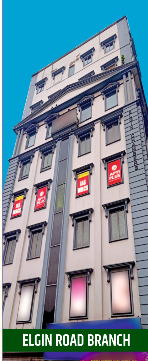
ELGIN ROAD BRANCH