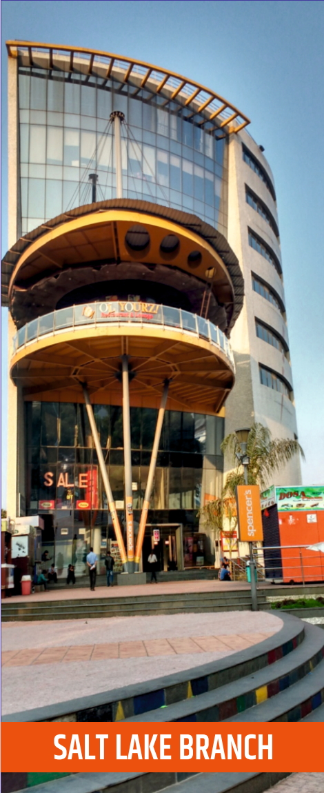
SALT LAKE BRANCH