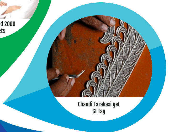
Chandi Tarakasi get GI Tag