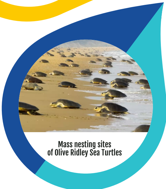
Mass nesting sites of Olive Ridley Sea Turtles