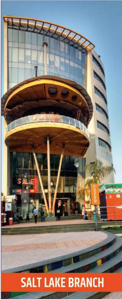
SALT LAKE BRANCH

Academy for Civil Service Pvt. Ltd. CREATING CIVIL SERVANTS FOR THE NATION