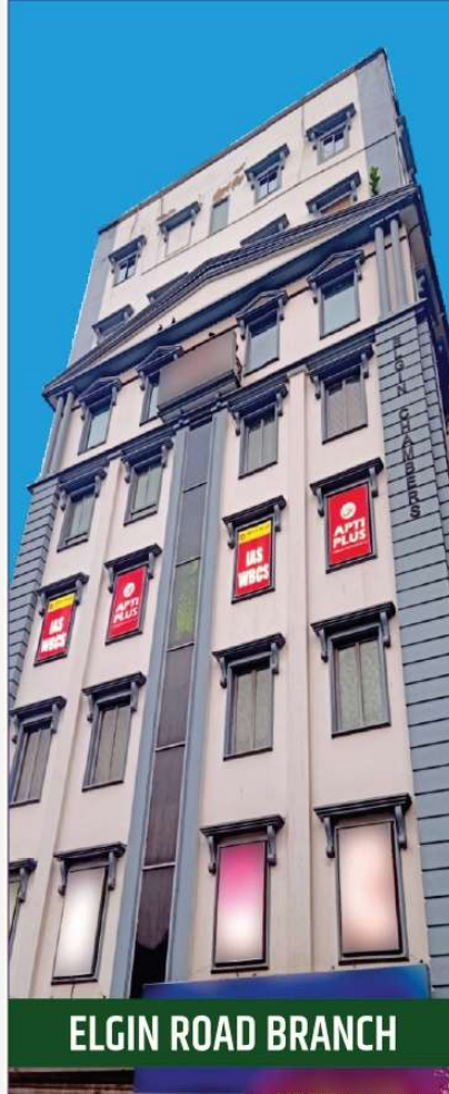
ELGIN ROAD BRANCH