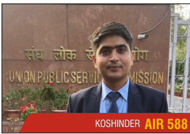
KOSHINDER AIR 588