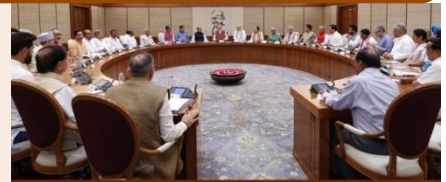
Cabinet approves Amendment in "Pradhan Mantri JI-VAN Yojana" for providing financial support to Advanced Biofuel Projects using lignocellulosic biomass and other renewable feedstock

Extends till 2028-29 , includes lingo cellulosic feedstocks and promotes innovation in biofuel technologies .